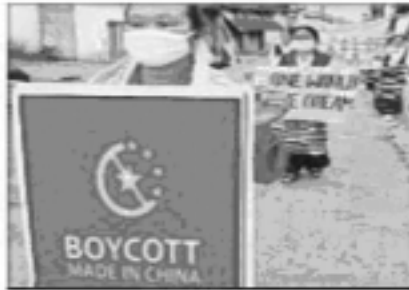
View of the rally in Arjuni Morgaon.

MEMBERS of Tibetan community living in exile at Norgyeling Settlement Centre in Pratapgarh of Arjuni Morgaon tehsil of Gondia district took out a peaceful rally and staged silent demonstration in front of Tehsil Office in Arjuni Morgaon on Friday, to expressing solidarity and respect for supreme sacrifices made by Indian soldiers in Galwan valley during conflict with Chinese