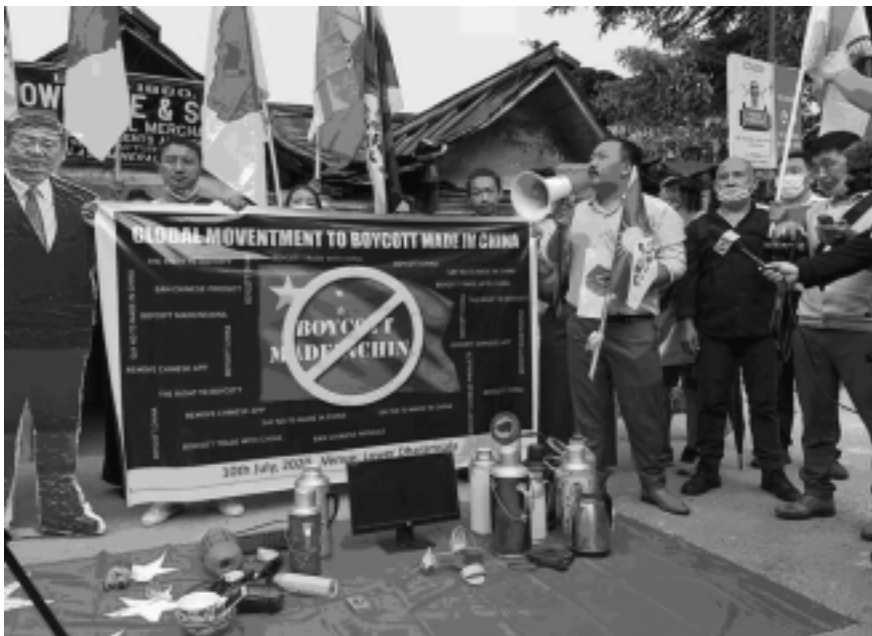
TYC Launch of the Global Movement to Boycott Made in China