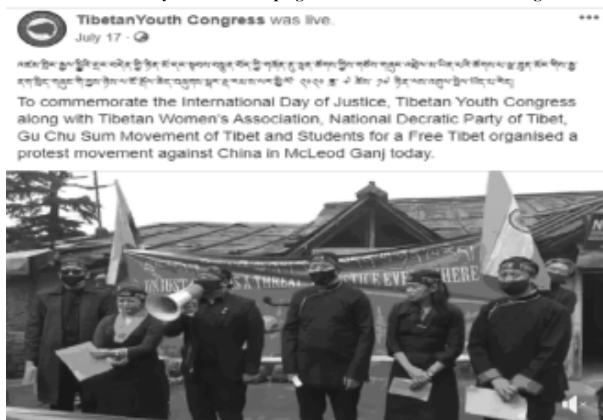
International Day of Justice campaign video on TYC social networking site